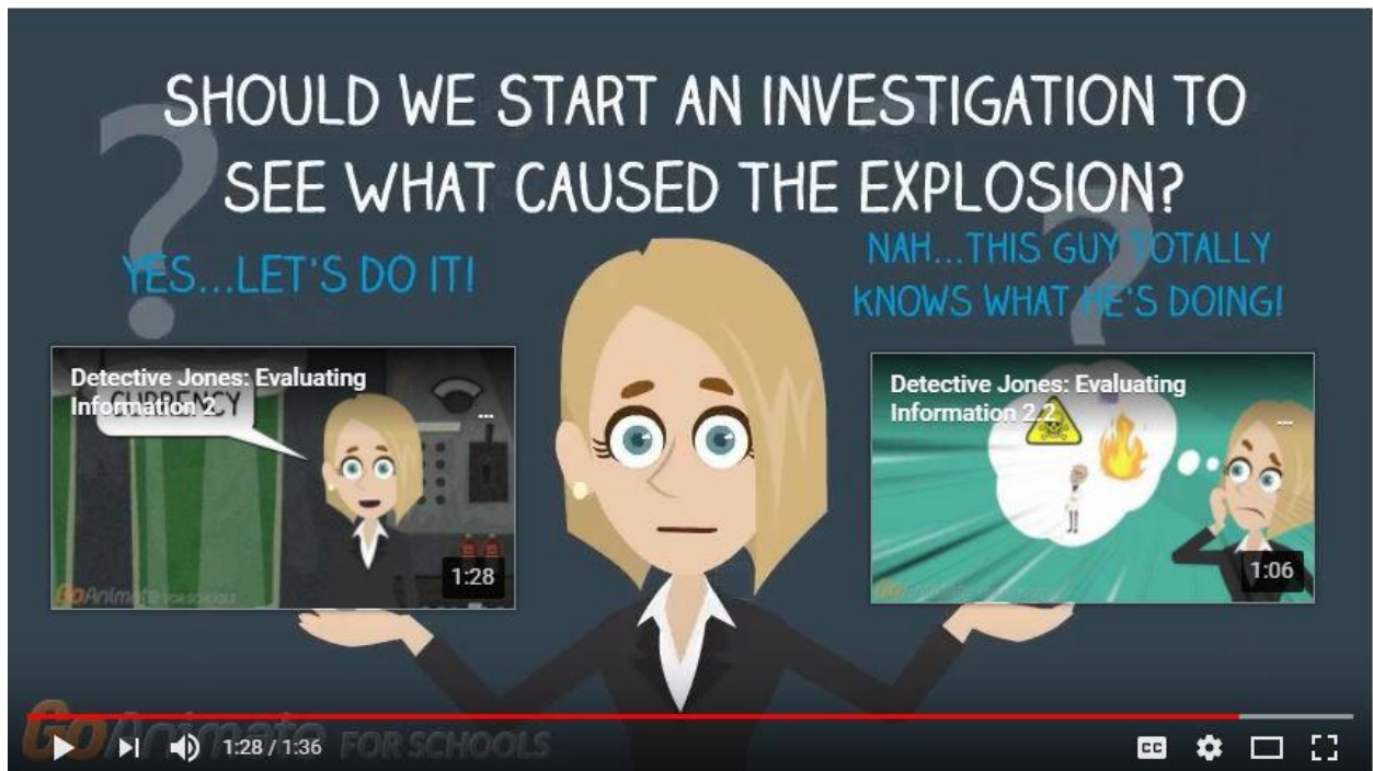
Figure 4: Example of the Choice Boxes in the Closing Credits of the First Video