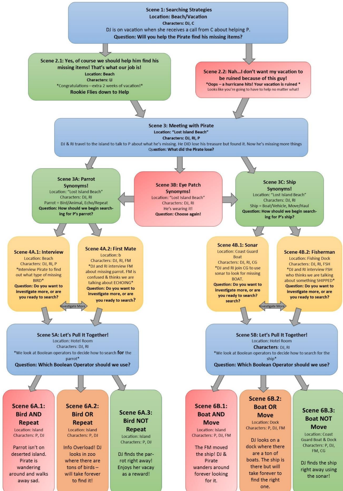
Figure 2: Storyboard for Search Strategies Module