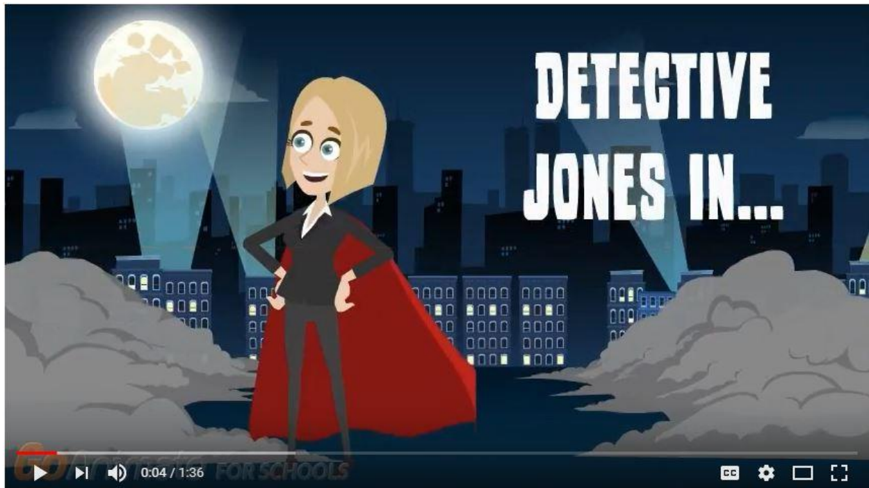
Figure 3: Example of the Opening Scene